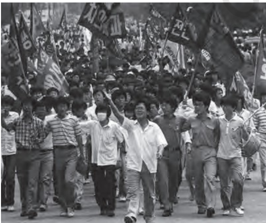
Demonstrators during the June Democracy Movement of 1987.

was forced to make a revision to the constitution, allowing direct elections. A new chapter of Korean democracy thus began.