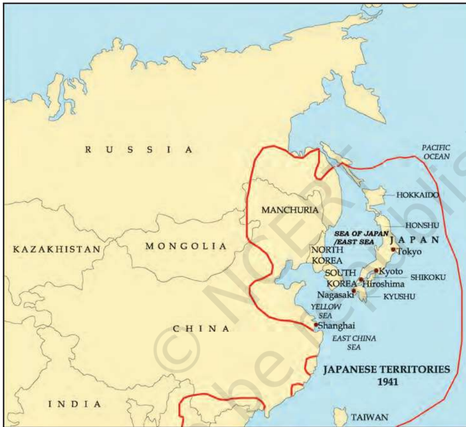
MAP 1: East Asia

China and Japan present a marked physical contrast. China is a vast continental country that spans many climatic zones; the core is dominated by three major river systems: the Yellow River (Huang He), the Yangtse River (Chang Jiang – the third longest river in the world) and the Pearl River. A large part of the country is mountainous.