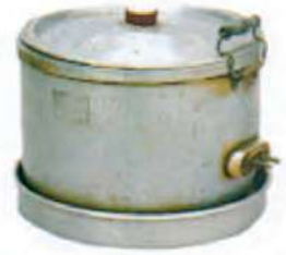
The novelty of electric goods: a rice-cooker, an American grill, a toaster.

housing available for a down payment of 200 yen and a monthly instalment of 12 yen for ten years – this at a time when the salary of a bank employee (a person with higher education) was 40 yen per month.