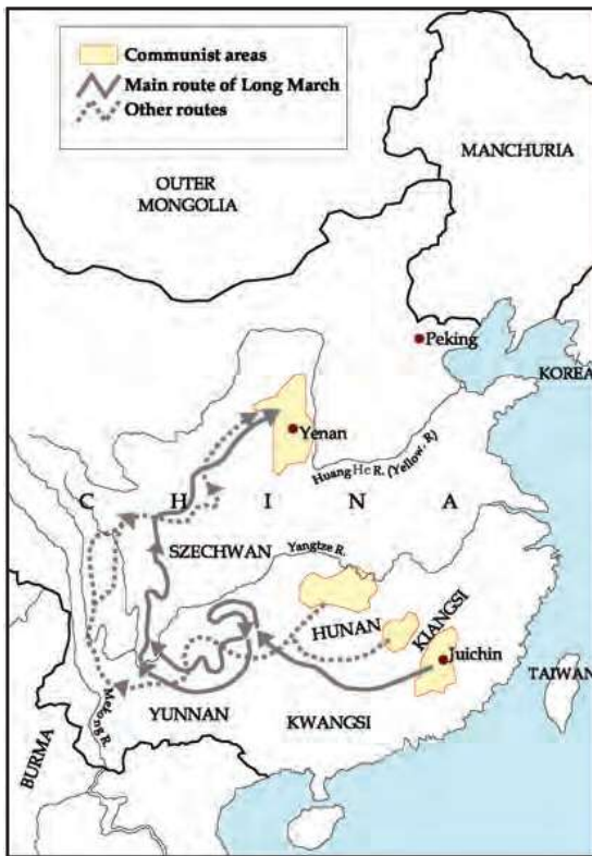
MAP 2: The Long March

Photograph of soldiers on the Long March reclaiming wasteland, 1941.