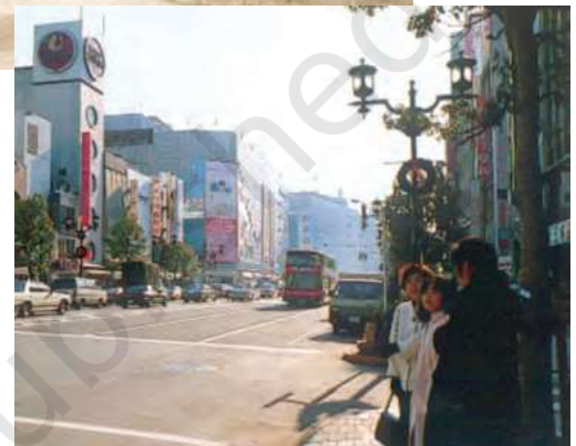
Tokyo before and after the Second World War.