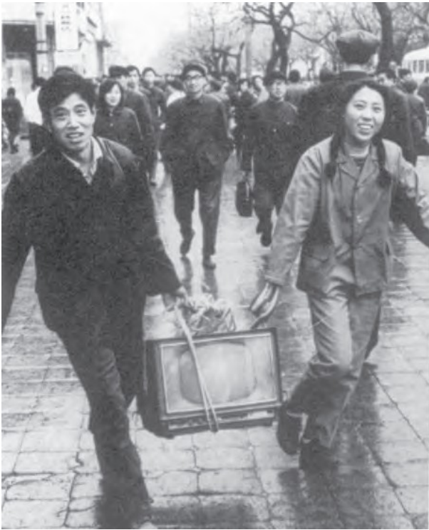
After the 1978 Reforms, the Chinese were able to buy consumer goods freely.

These demands were suppressed, but in 1989 on the seventieth anniversary of the May Fourth movement many intellectuals called for a greater openness and an end to 'ossified dogmas' ( su shaozhi ). Student demonstrators at Tiananmen Square in Beijing were brutally repressed. This was strongly condemned around the world.