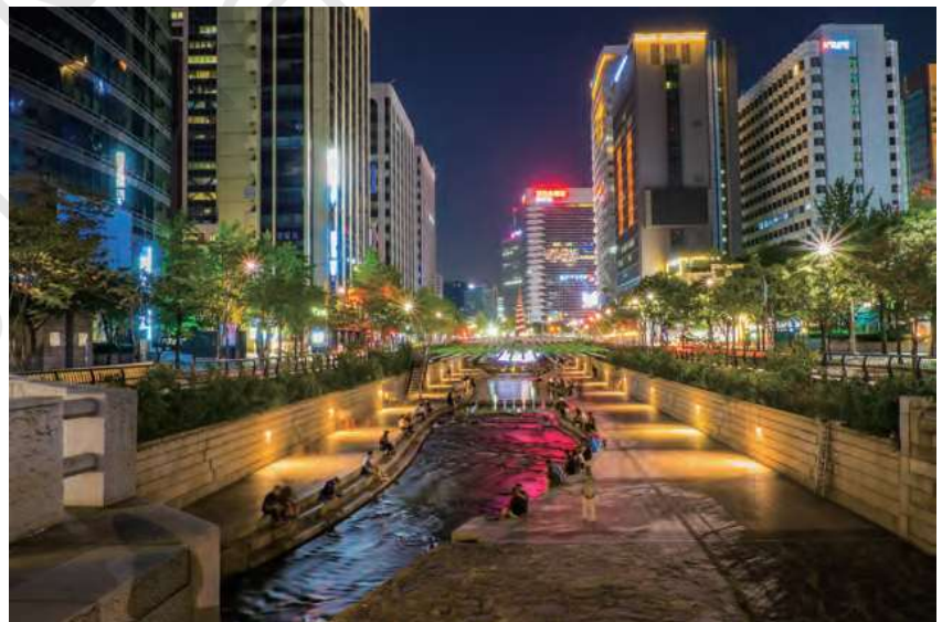
Present-day downtown Seoul at night.

In December 1997, long-time opposition party leader Kim Dae-jung was elected the president for the first time in Korea, marking a peaceful transfer of power. The second peaceful transfer of power came in 2008, when conservative Lee Myung-bak was elected as the president, following the progressive Roh Mu-hyun administration. In 2012, conservative Park Geun-hye was elected as the first female president. At the beginning of her presidency, she gained support due to the political legacy of her father, Park Chung-hee. But in October 2016, as it came to light that she had let a friend secretly manage government affairs, she met with nationwide protests, leading to her impeachment and removal from office in March 2017. In May 2017, Moon Jae-in was elected the president, in a peaceful transfer of power for the third time.