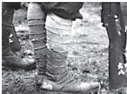
Young people being exhorted to fight for the nation: a magazine cover. Student-soldiers: photographs.