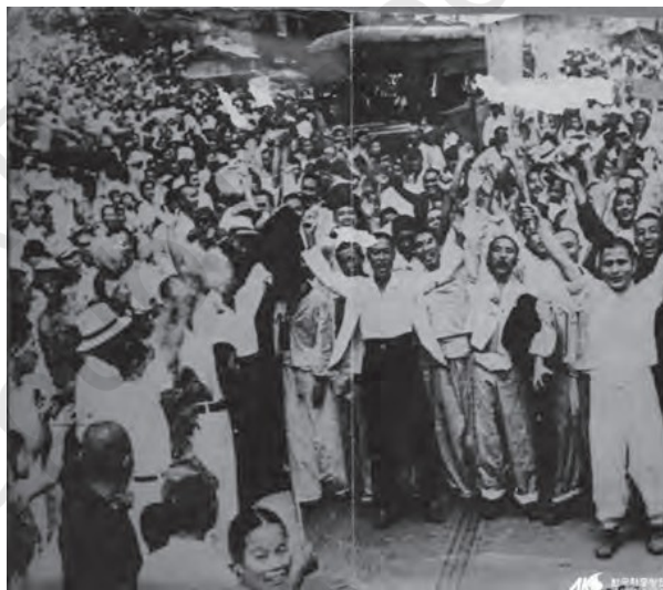
Koreans celebrate their independence from Japan in 1945.

In June 1950, the Korean War broke out. With South Korea receiving support from the US-led United Nations forces and North Korea receiving support from communist China, it developed into