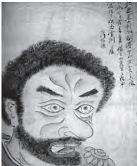
Commodore Perry as seen by the Japanese.

At the same time, the new government also worked to build what they called the 'emperor system'. (Japanese scholars use this term as the emperor was part of a system, along with the bureaucracy and the military, that exercised power.) Officials were sent to study the European monarchies on which they planned to model their own. The Emperor would be treated with reverence as he was considered a direct descendant of the Sun Goddess but he was also shown as the leader of westernisation. His birthday became a national holiday, he wore Western-style military uniforms, and edicts were issued in his name to set up modern institutions. The Imperial Rescript on Education of 1890 urged people to pursue learning, advance public good and promote common interests.